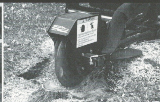
SG50 Stump Grinder