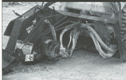
WS12 Wheel Saw

The 763H and a Bobcat Planer. It also powers the Bobcat high flow attachments shown below: