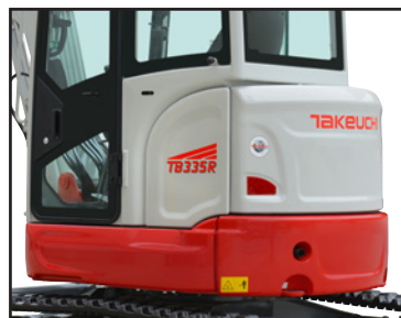
All Steel Construction