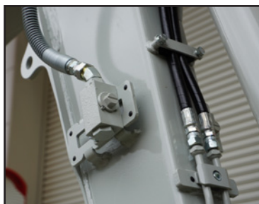
Up to 4 Service Ports (Optional)